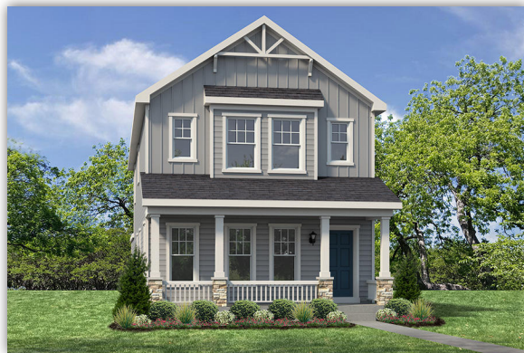
ELEVATION IV OPTIONAL STONE COLUMN BASES & OPTIONAL RAILING