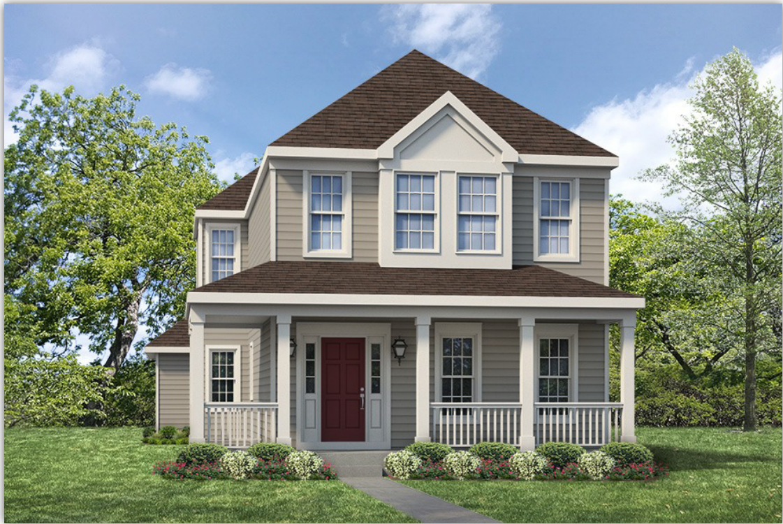
ELEVATION III OPTIONAL RAILING/WRAPAROUND PORCH