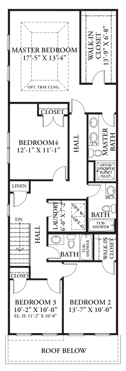
SECOND FLOOR 1,285 SQ. FT.