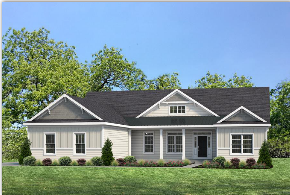
ELEVATION II OPTIONAL PAC CLAD ROOF