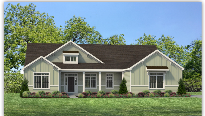
ELEVATION III OPTIONAL DORMER & OPTIONAL PAC CLAD ROOF