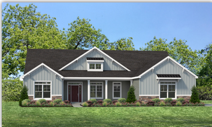
ELEVATION IV OPTIONAL STONE, OPTIONAL DORMER & OPTIONAL PAC CLAD ROOF