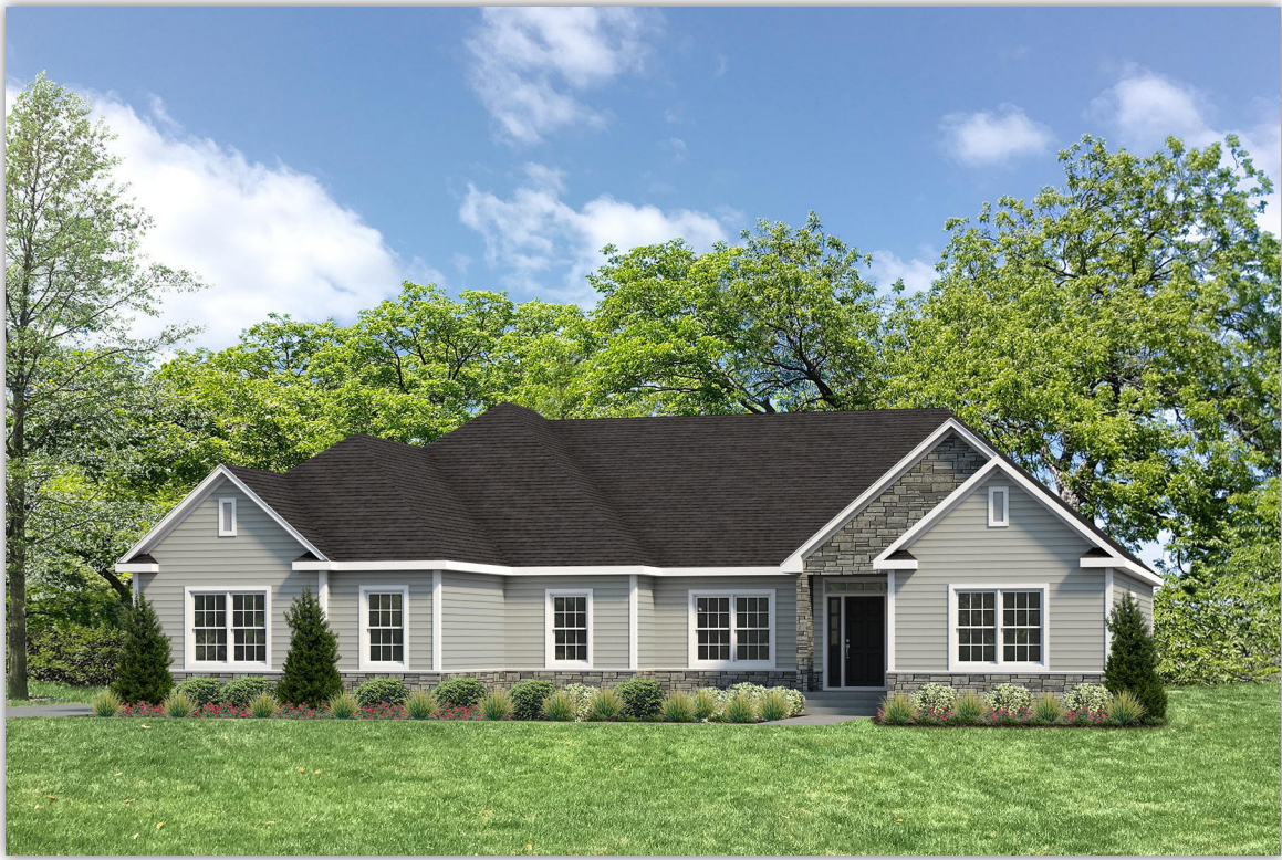
ELEVATION I OPTIONAL STONE