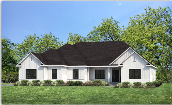
ELEVATION II OPTIONAL BLACK WINDOWS