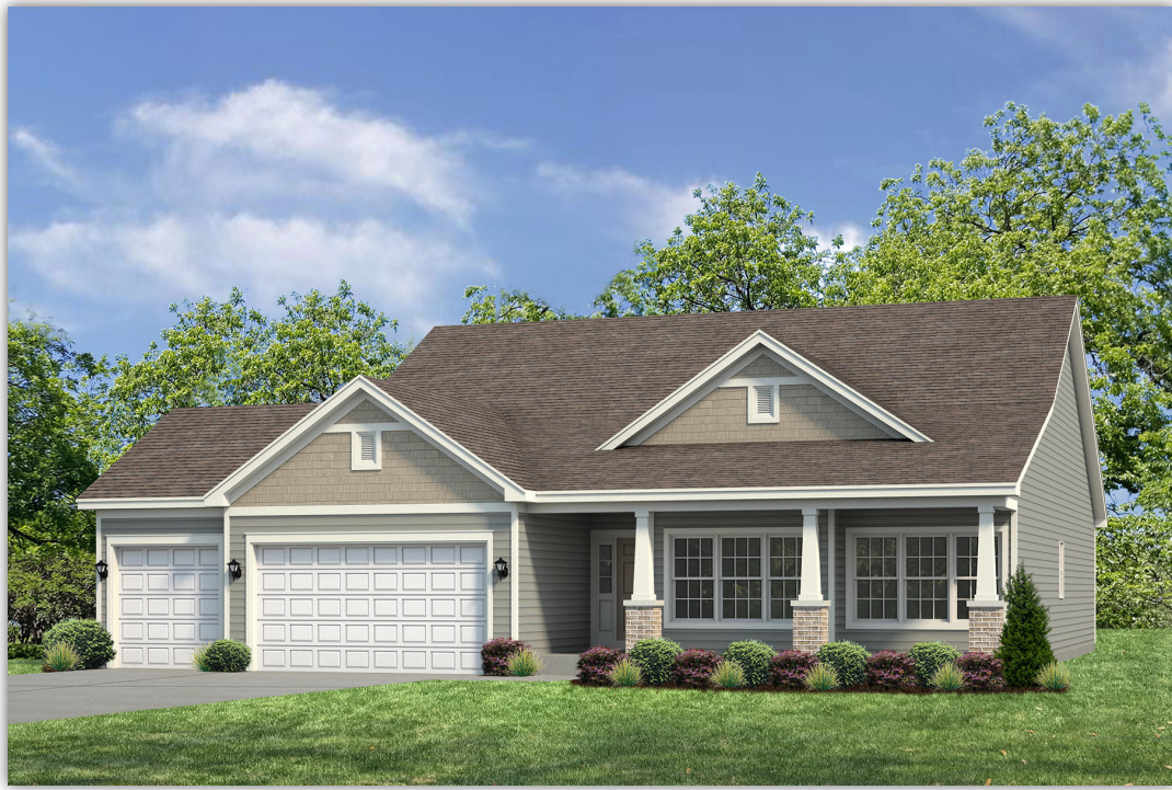
ELEVATION II OPTIONAL WINDOWS, OPTIONAL THREE-CAR GARAGE AND OPTIONAL BRICK ON COLUMNS