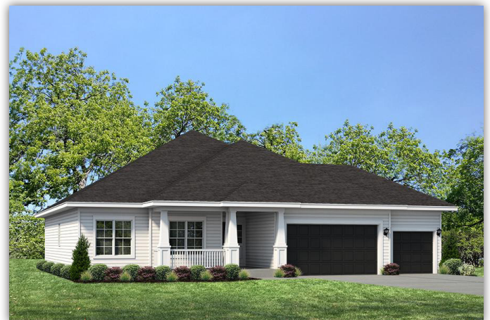
ELEVATION III OPTIONAL RAILING & OPTIONAL THREE-CAR GARAGE